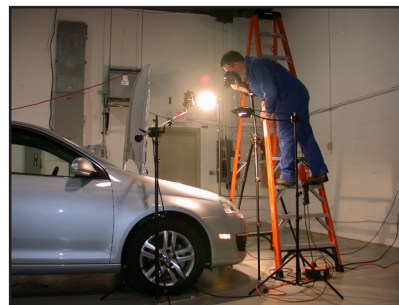
Technical photography session

Bentley repair manuals provide the highest level of clarity and comprehensiveness for service and repair procedures. If you're looking for a better understanding of your 2006 through 2009 Rabbit or GTI, look no further than Bentley.